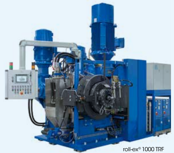
roll-ex® 1000 TRF